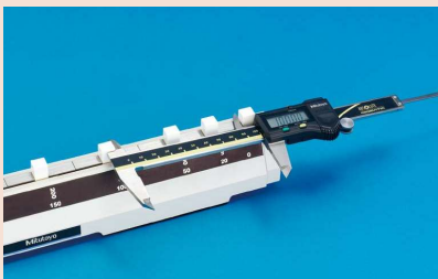
Checking accuracy of caliper (inside measurement)