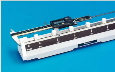
Checking accuracy of caliper (outside measurement)