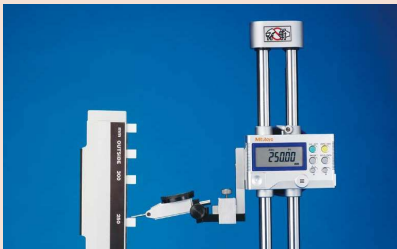
Checking accuracy of height gage